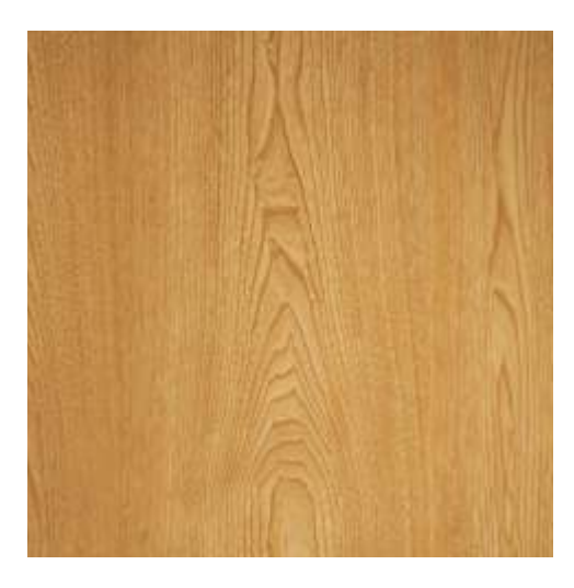
* Natural Oak