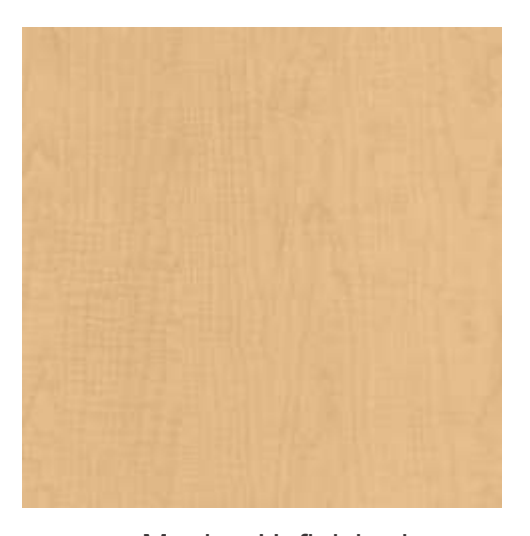
Maple - Unfinished