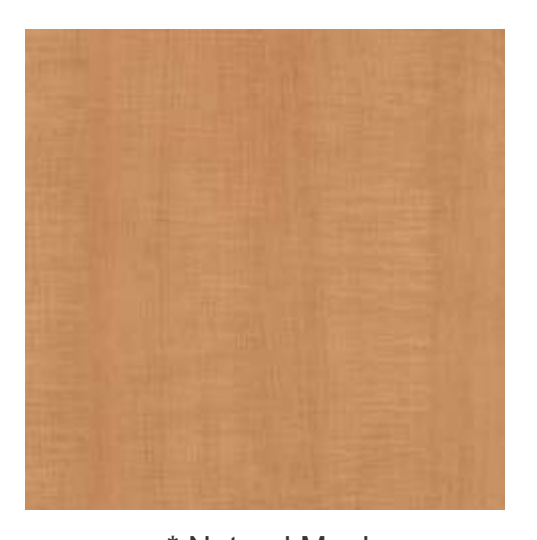
* Natural Maple

THE INFORMATION CONTAINED HEREIN IS SOLELY OWNED BY RESIDENTIAL ELEVATORS, INC. ANY REPRODUCTION IN PART OR AS A WHOLE WITHOUT WRITTEN PERMISSION FROM RESIDENTIAL ELEVATORS, INC. IS STRICTLY PROHIBITED.